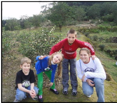
Left: at church friends' family home in the countryside

Thank you for your constant and faithful support of our family and our life and ministry in Taiwan. There are communities of believers in places where there once were not because of your partnership in the gospel and God's great love for people.